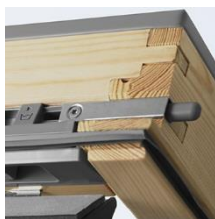
6 Barrel bolt • plastic • colour: grey • steel • colour: "silver"