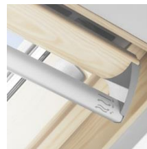
4 Control bar • anodised aluminium