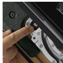
3 Click-on covers • lacquered aluminium