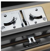
1 Lock casing • electro-galvanised steel • colour: "silver"