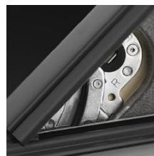
7 Hinges with friction • electro-galvanised steel • colour: "silver"