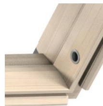
8 Barrel bolt bushings • plastic • colour: grey