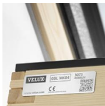
2 Data plate • window type, size and variant code • CE marking • production code • QR code